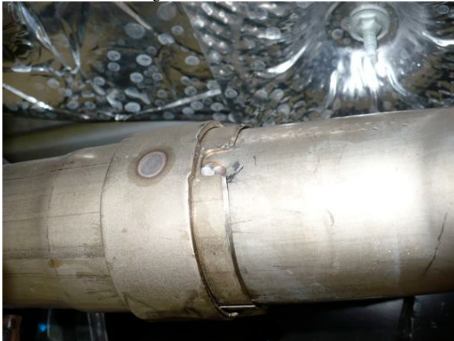
Image 3.2 with exhaust rivet removed