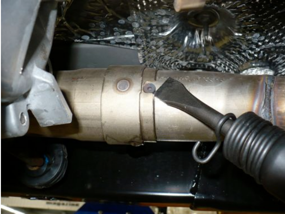
Image 3.1 Exhaust rivet location

hammer with a chisel end works great for this. However it can easily be removed by hand with a hammer and chisel if an air hammer is not available. See image 3.1 and 3.2 below for before / after reference photos.