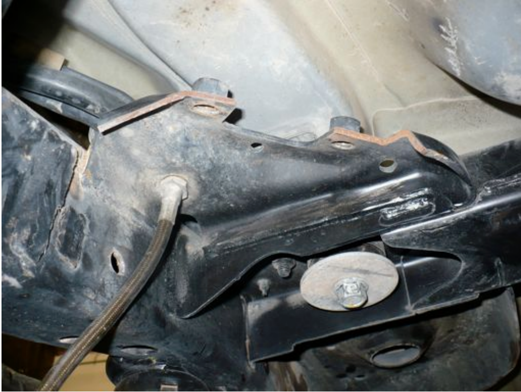
Picture 2.2 Example of properly trimmed stock shock mount