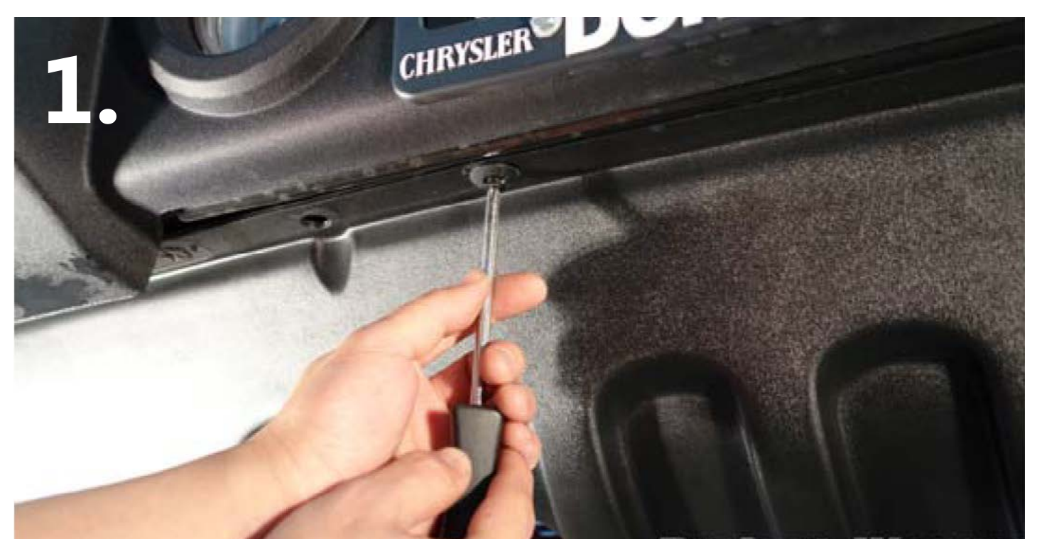
Begin the installation of your new LoD signature series shorty front bumper by unscrewing the 4 plastic screws securing the factory air dam to the bottom of your front bumper. a phillips screwdriver will be needed for this job.