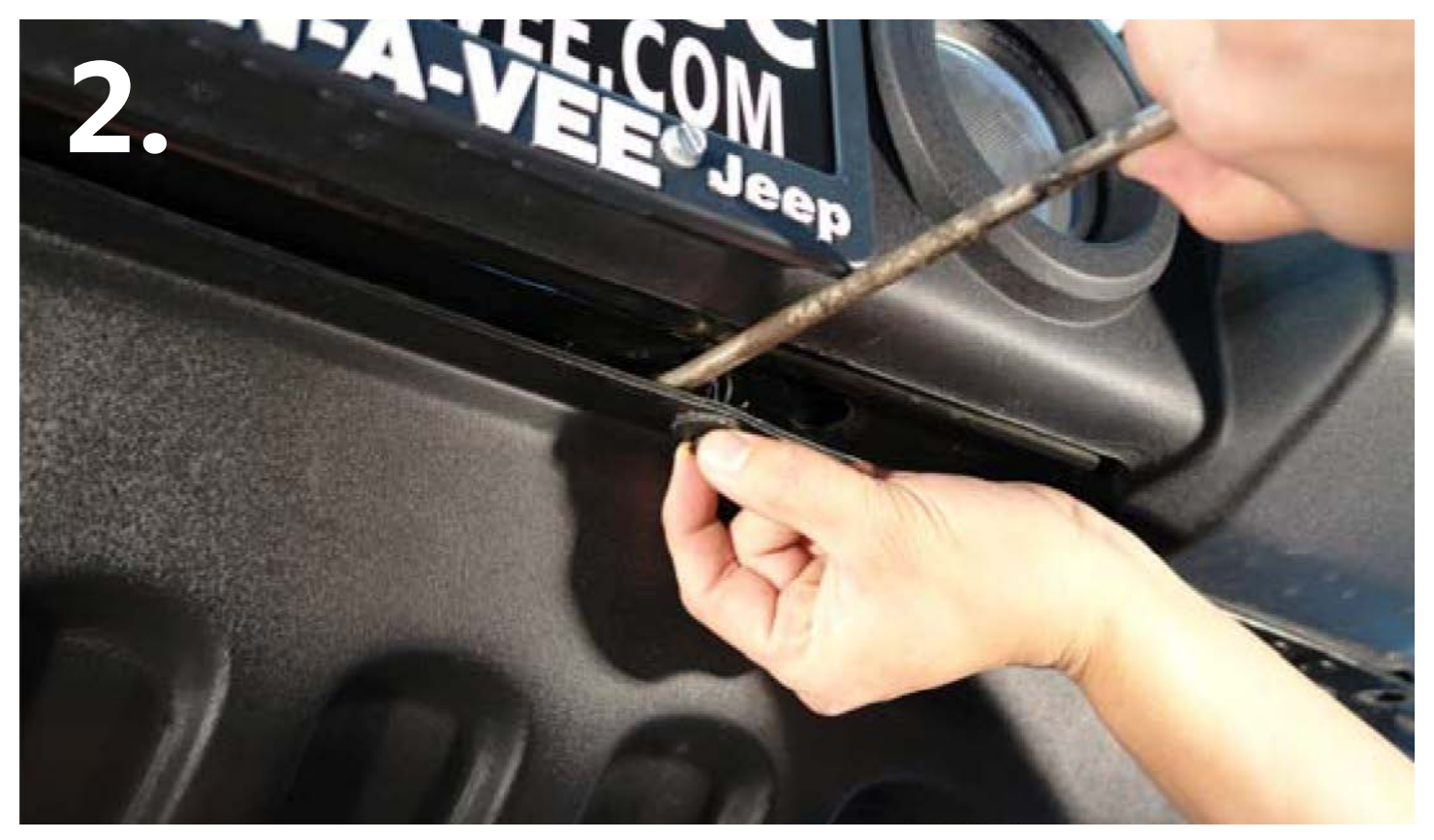
Once unscrewed, you should be able to pull out both the plastic screws and insert with little effort but if you find the screws just spin, you will need to wedge a flathead screwdriver between your JK's plastic bumper and air dam to help you remove it.