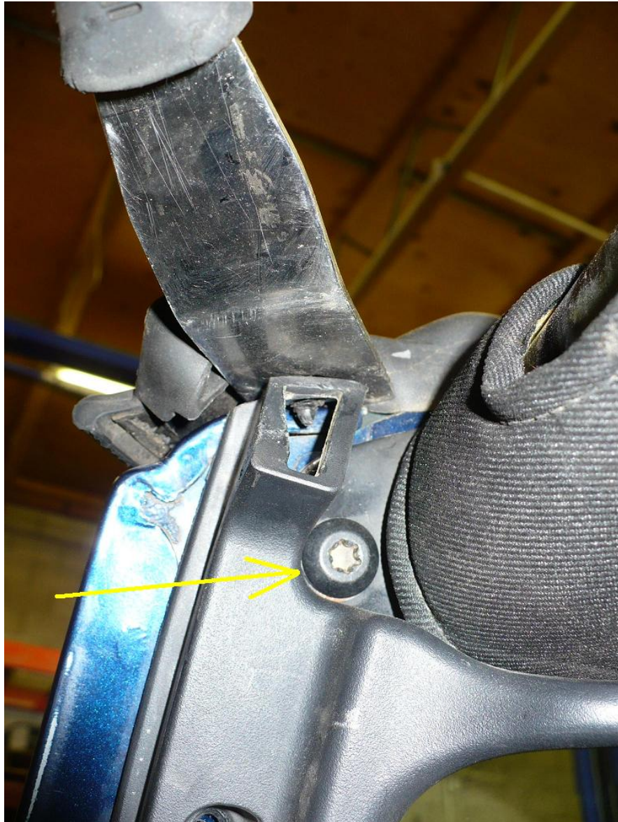
Plastic barb fastener at top of A-pillar trim