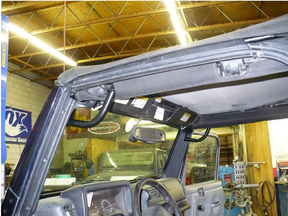
Completed install of PPM-5804 TJ Front Grab Handles

Please use cutout template available at http://www.synergymfg.com/instructions/5804_Cutout_Template.pdf