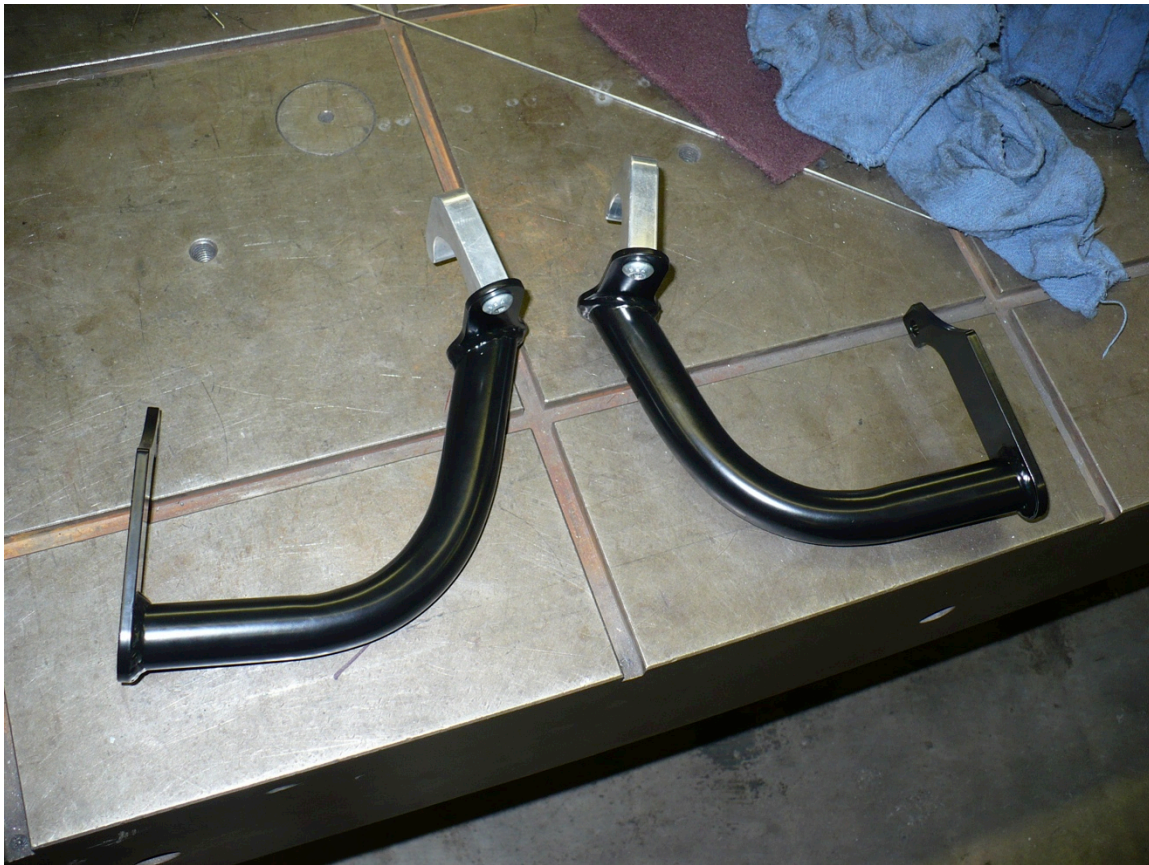
Complete PPM-5804 TJ Front Grab Handle Kit