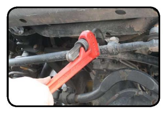
36. Re-torque all fasteners after 300 miles.